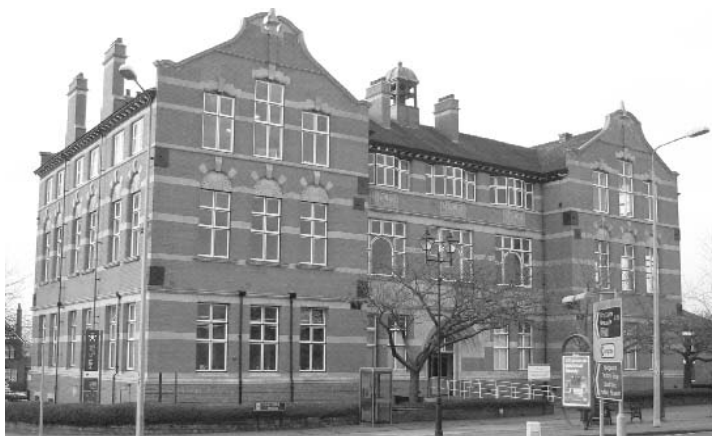
The Sutherland Institute, now being used as a library and, below, the foundation stone laid by the Prince of Wales.

lower stone, a casket containing the current coins of the realm, from the sovereign downwards, and copies of The Times, The Staffordshire Advertiser, The Staffordshire Sentinel and The Longton Times and Echo.