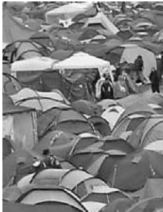
So where exactly did we leave our tent?

And they managed to dismantle and pack up around 250 tents and other camping equipment which will be sent overseas to provide shelter in a disaster area.