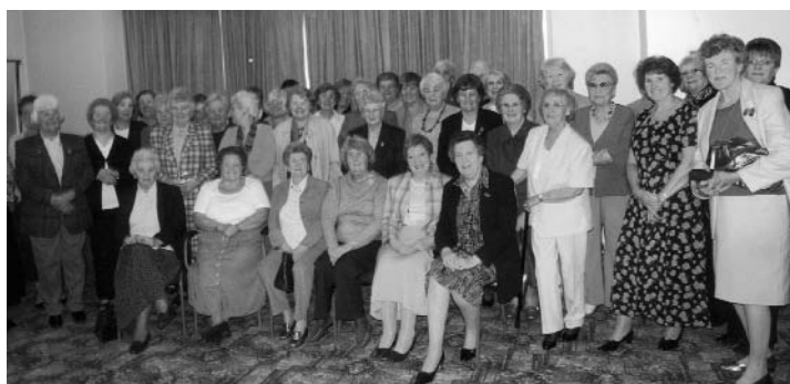
Members of The Wednesday Club at one of their recent meetings

The costs involved in membership are not great; at present (2007) we have a joining fee of £5.00, an annual membership fee of £10.00 plus the cost of the meal on the day (usually about £10.00). Current membership is in excess of 55 with the majority of members from the Stoke-on-Trent area, but some