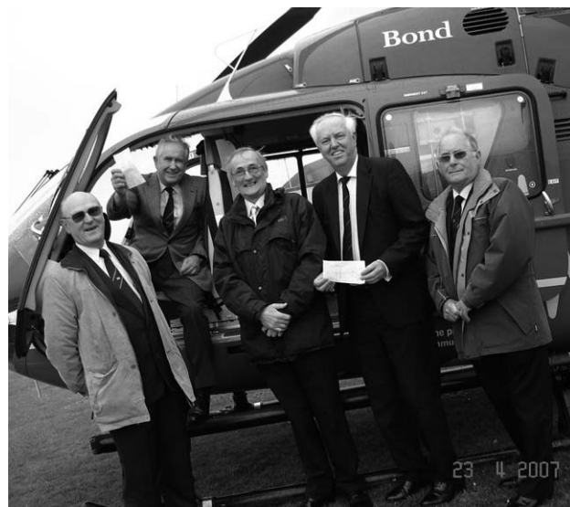
The Provincial Grand Master and Secretary of the SMCA are pictured left, at the Air Ambulance presentation