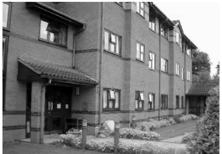
The front of Wilson Keys Court in Rugeley

The daily running of the building is carried out by the House Committee,