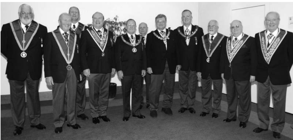
The Staffordshire and Shropshire 2007 Mark Benevolent Fund Festival Committee.